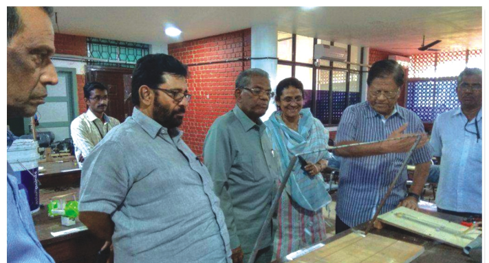
Management committee members inspecting the Make Things Lab