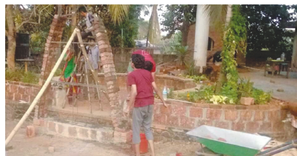
Workshop on arches