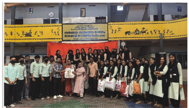
Students visiting Tavanur old age home