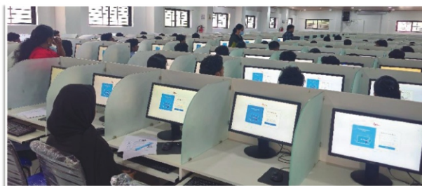
Campus Recruitment Drive By South Indian Bank Ltd.