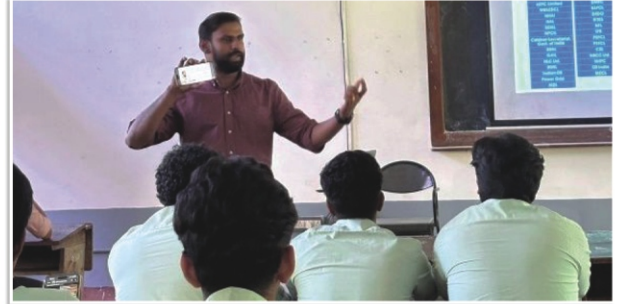
Competitive Examinations Awareness Programme

Matrics and Ones Education Academy jointly organised an awareness programme on GATE, IES, PSC and SSC examinations on January 16.