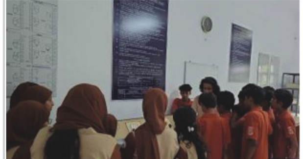
"Dive into Electronics" Workshop

AECE organised an outreach programme "Dive into Electronics" for high school students on December 5. Students learned about various projects in the programme.