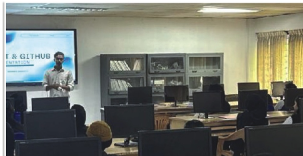
Git and Github Workshop

NSS Unit 304 actively participated in the State Level Plastic Waste Collection Challenge organised under the Swachhta Action Plan at Ponnani Beach on January 16. NSS volunteers successfully collected 35 kg of plastic waste for proper disposal.