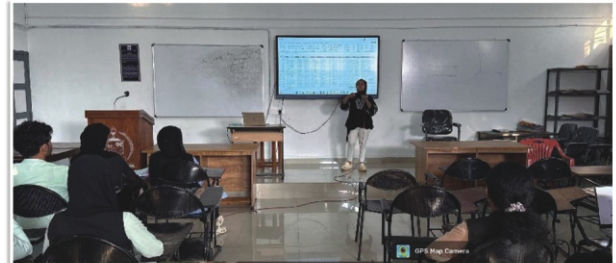
A moment from the Power BI workshop