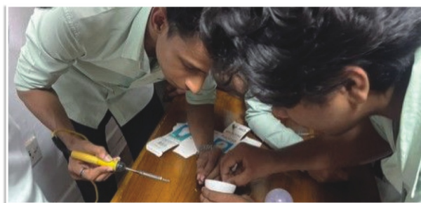
LED Bulb Repair Workshop

An LED bulb repair workshop was conducted under NSS Unit 304 to promote practical skills and raise awareness about energy conservation on December 17.