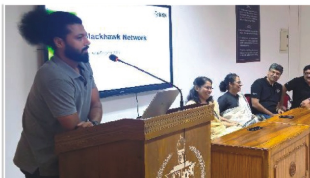
Campus Recruitment Drive By Blackhawk Network

Infosys, Harion Research, GenZ Educatewing, Recruit CRM, Blackhawk Network, Key Value Software Systems, The South Indian Bank Ltd., Kalvium, Electric Buy, Schneider Electric, Zafin (MuLearn Campus), Ramco Cements, Mindenious Edutech, EY Global Delivery Services, Tokyo Freight, Tech Mahindra, Dr. Bee Food Products, EDMO (iSchoolConnect), Techens Global Hyosung, and T&D India Pvt. Ltd., Core Fit Care and Safeline Group of Companies conducted campus recruitment drives for the 2022 - 2026 Batch.