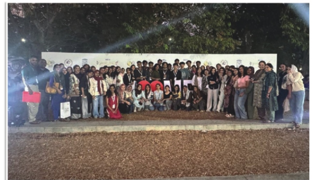
Participants from MES College of Engineering, Kuttippuram