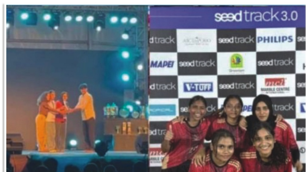
Students of MES School of Architecture who won the Runners-Up award in the SEEDTRACK 2025 3s Football event