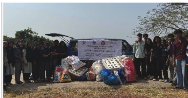
Scrap collection programme organised by NSS Unit 191

NSS Unit 191 organised a Scrap Collection Programme, aimed to promote environmental awareness and responsible waste management among students. Volunteers collected recyclable materials, including paper, plastic, metal, and e-waste, from the campus and nearby areas.