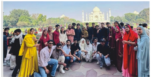
S8 CSE B Students in front of Taj Mahal