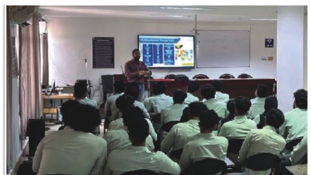
GATE Orientation Programme for S4 Students