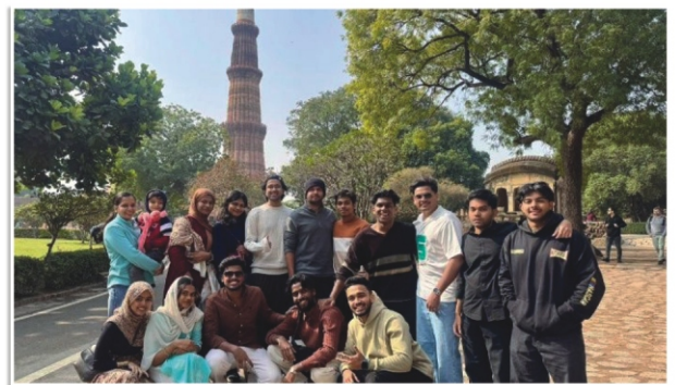
S8 students visiting Qutb Minar