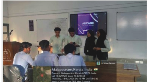
“Arcane-Vibe Coding Challenge” Workshop

ADTEC organised a hands-on workshop focussed on web development, titled “Arcane-Vibe Coding Challenge,” for all college students on December 18.