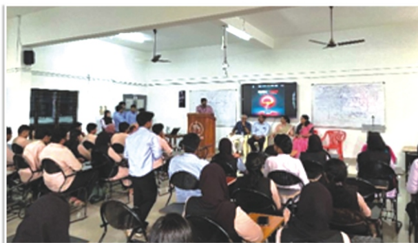
Inauguration of Coding Club

A coding club called 'Codex' was established under Matrics on September 11.