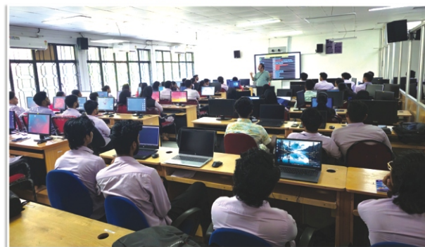
Technical Training Programme By Manifold