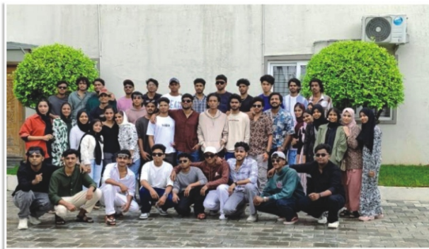
Industrial Visit By S5 Students

S5 students went for an industrial visit to Karnataka from July 19 to July 21.