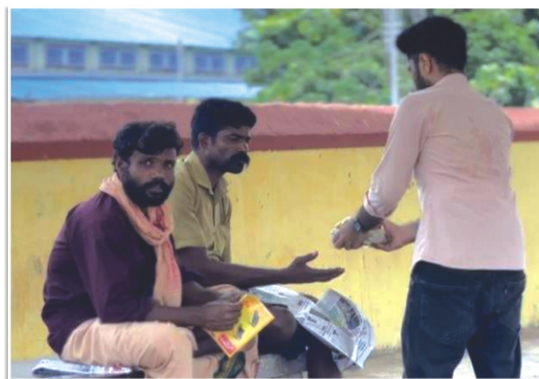
Food distribution by NSS Volunteers

Volunteers of NSS Unit 304 distributed food to those in need at nearby railway stations and bus stands on September 27.