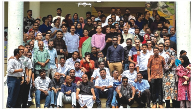
Participants of Rajatham 2024