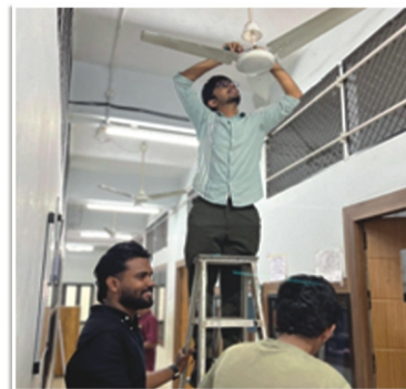
Students of the department repairing the electrical components of Govt. Taluk Hospital, Kuttippuram

As part of their community service, students of the department repaired and replaced the electrical components of Govt. Taluk Hospital, Kuttippuram including LED lights, fan capacitors, switches and wall plugs on September 10.