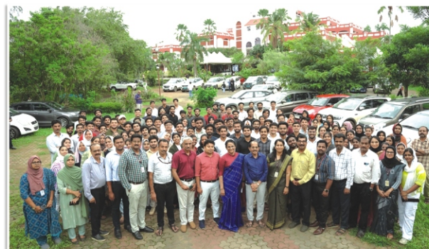
Participants of Placement Day