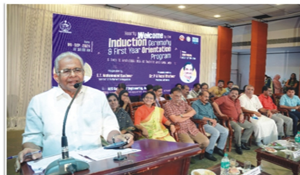
Inaugural Address By Mr. E.T. Muhammed Basheer, MP