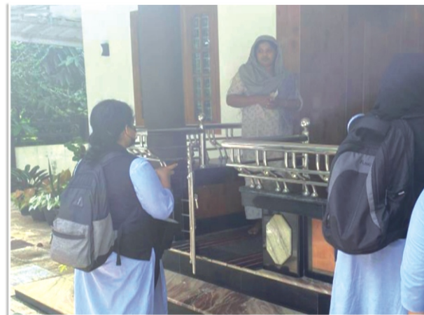
DigiKeralam survey by NSS volunteers