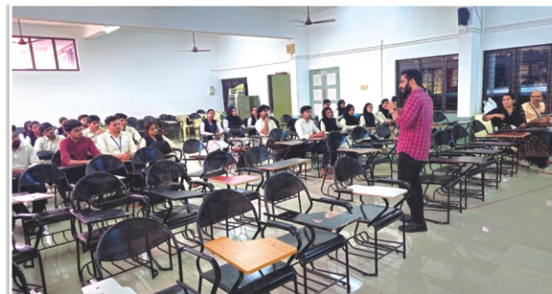
Campus Placement Drive By Fantacode

She also attended the Placement Officers Conference conducted by Placement Officers Consortium at Kochi on August 23.