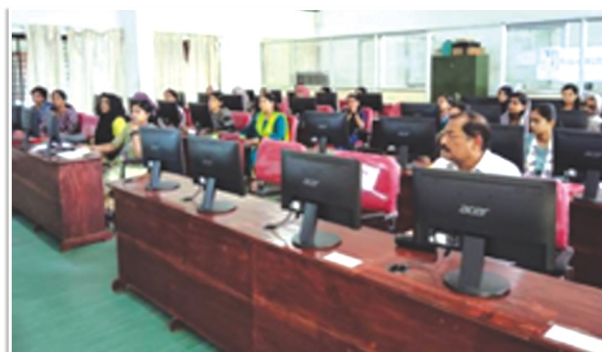
FDP on Artificial Intelligence