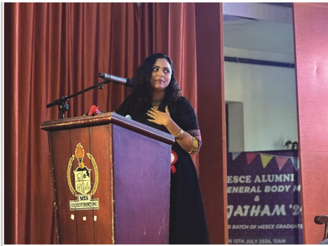
Ms. Vincy Alosious, Actress addressing the gathering