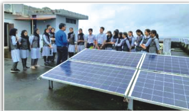
Workshop on Solar Energy

‘Solaire 23’, a workshop on Solar Energy for Engineering Diploma, Plus 1, Plus 2 and Plus 2 Passout students was conducted on July 19 and 24 respectively. The workshop was organised to make young people aware of the deployment of solar energy.