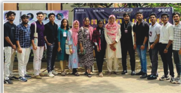
Participants of the All Kerala Students Congress 2023