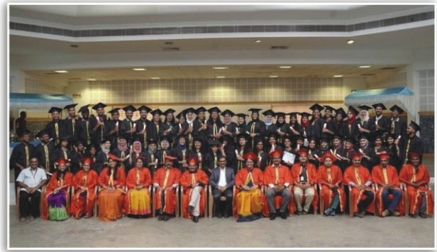
2021 - 2023 batch along with faculty members and dignitaries at the passing out ceremony