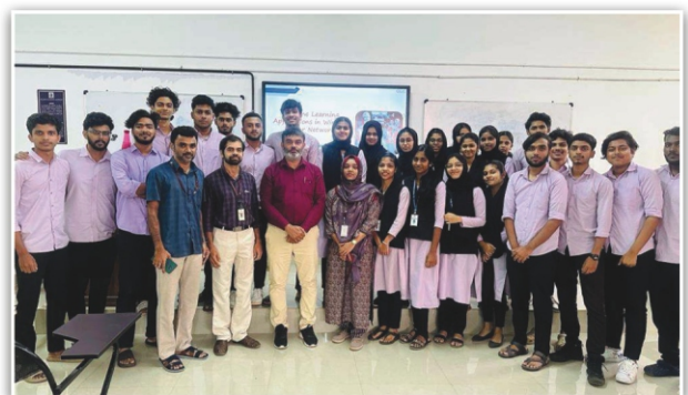
Participants in the Seminar on 'Machine Learning Applications in WSN'