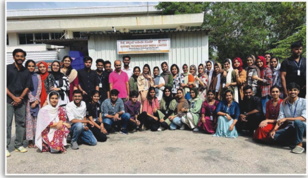
S2 students visiting Kaynes Technology