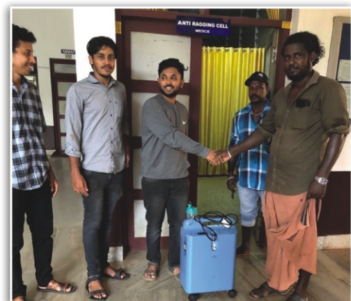
Oxygen Concentrator Support

As a palliative care initiative, NSS Unit 191 started providing oxygen concentrator support to needy patients in June 2023.