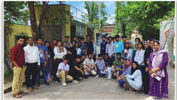
S2 students in front of Malabar Cement Manufacturing Plant, Palakkad