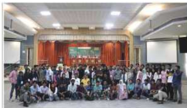
Participants of the event