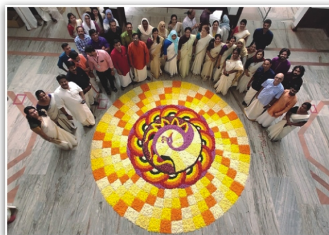
Pookkalam created by the staff in front of the main building

Onam was celebrated by the college staff on 1st September. Pookalam, Thiruvathira Kali, Vadam Vali, Uriyadi, songs, and other events were among them. Staff members were divided into four houses: Mandaram, Mukkutti, Thechi and Thumba. On the same day, a grand onam feast was also served.