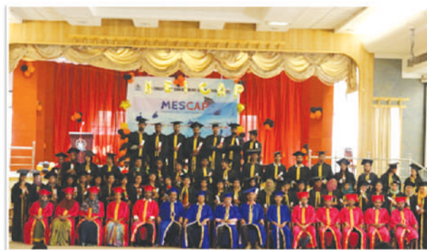
Participants of MESCAP 2019

The event included expert lectures and project presentations, panel discussions, product exhibitions and presentations, exhibition of academic work and student exhibitions.