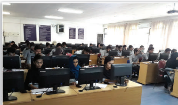
Online Recruitment Test by QBurst

He also attended the placement drives conducted by Poornam Infovision at Vidya Academy of Science and Technology and Chegg Inc. at UC College, Aluva on 27th and 28th September respectively.