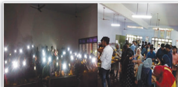
Student Solar Ambassador Workshop

The department organised a workshop titled 'Student Solar Ambassador Workshop' to assemble solar study lamps in association with IIT Bombay on 2nd October.