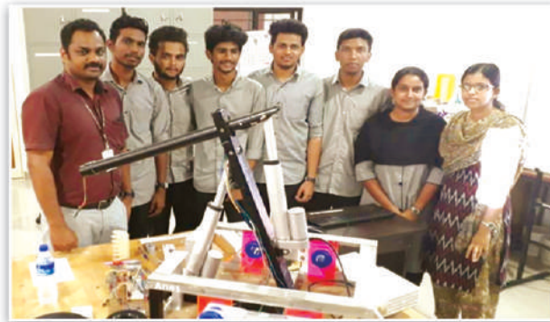
Team Members of the Project 'Agrobot' Along With Their Faculty Guides