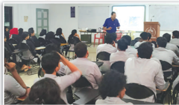
Augmented Reality Workshop