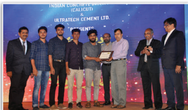
ICI students' chapter of MESCE receiving the Best Students Chapter Award