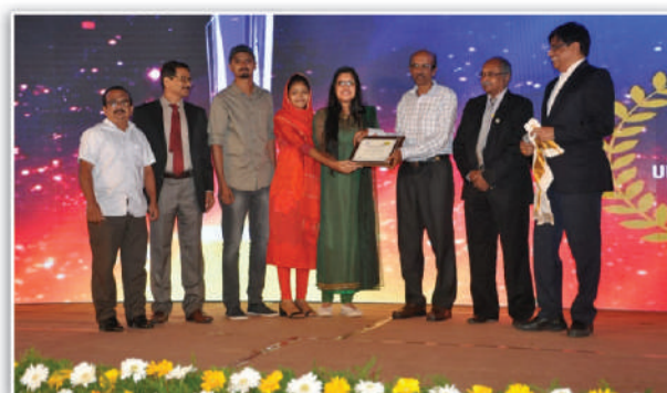
Students of 2015-2019 B.Tech CE Batch Receiving the ICI Calicut Chapter and Ultra Tech Cements Best Innovative Project Award