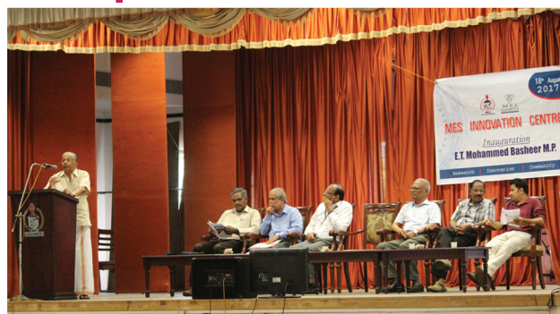
Inaugural Address By Sri E T Muhammad Basheer, Hon. MP